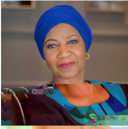
Phumzile Mlambo-Ngcuka Executive Director of UN Women

A conversation about leadership and reflection about what was shared today. Taking questions from the Women Rise for All Event chat. Moderated by Zain Verjee.